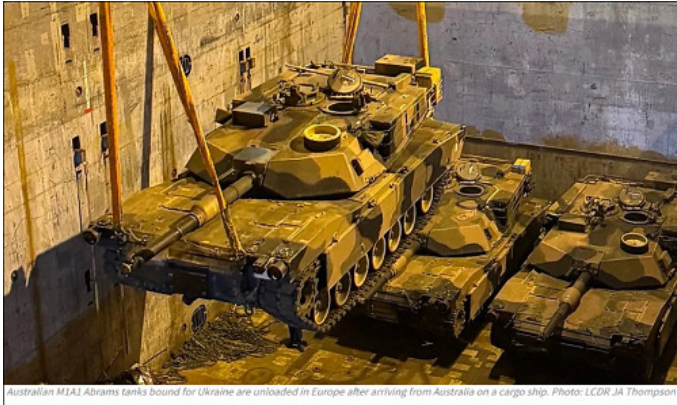
Australian M1A1 Abrams tanks bound for Ukraine are unloaded in Europe after arriving from Australia on a cargo ship.